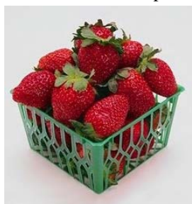
Figure 1. Strawberries

The purpose of this trial was to evaluate the efficacy of the Metalosate® products when applied to strawberries. The parameters observed were weight, firmness, and sugar content (Brix) of the berries. Total number of berries per plant was also observed. The total yield per treatment was also calculated based on averages taken from the test plots.