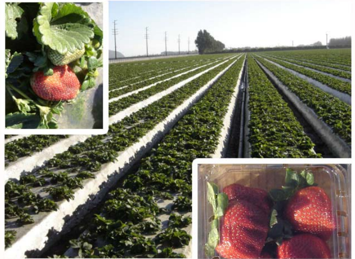
FIGURE 2. STRAWBERRIES FROM THE TEST LOCATION

For more information on how the Metalosate products can help you to become more profitable and for the complete report of this research project please contact your local Albion Plant Nutrition representative. www.albionminerals.com