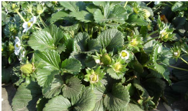
FIGURE 1. INCREASED CROWN DEVELOPMENT

program, and an Albion program based upon T.E.A.M. analysis of the leaves. Both the Albion-standard program and the one based on T.E.A.M. suggest materials and rates utilizing many of the Metalosate ® products, with particular emphasis on Metalosate Zinc and Metalosate Copper. Nine applications were made between November 15, 2006, and March 2, 2007, on a two to three week interval.